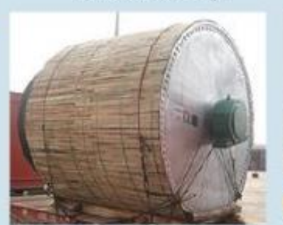
Dynamic Balance Test