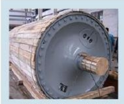
1500Dia. Dryer Cylinder