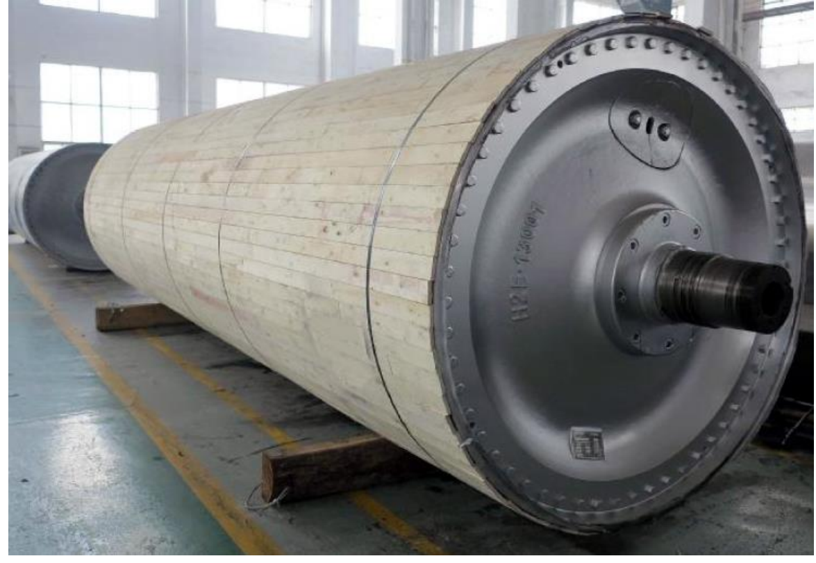
Page 3 of Total 4 Pages