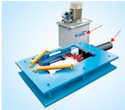
OTHER CHINESE BRANDS